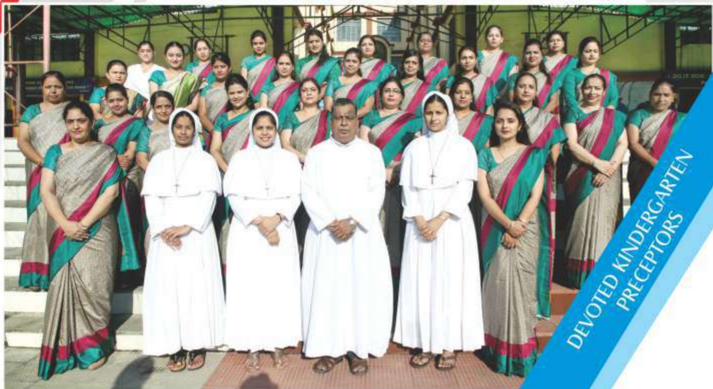
DEVOTED KINDERGARTEN PRECEPTORS