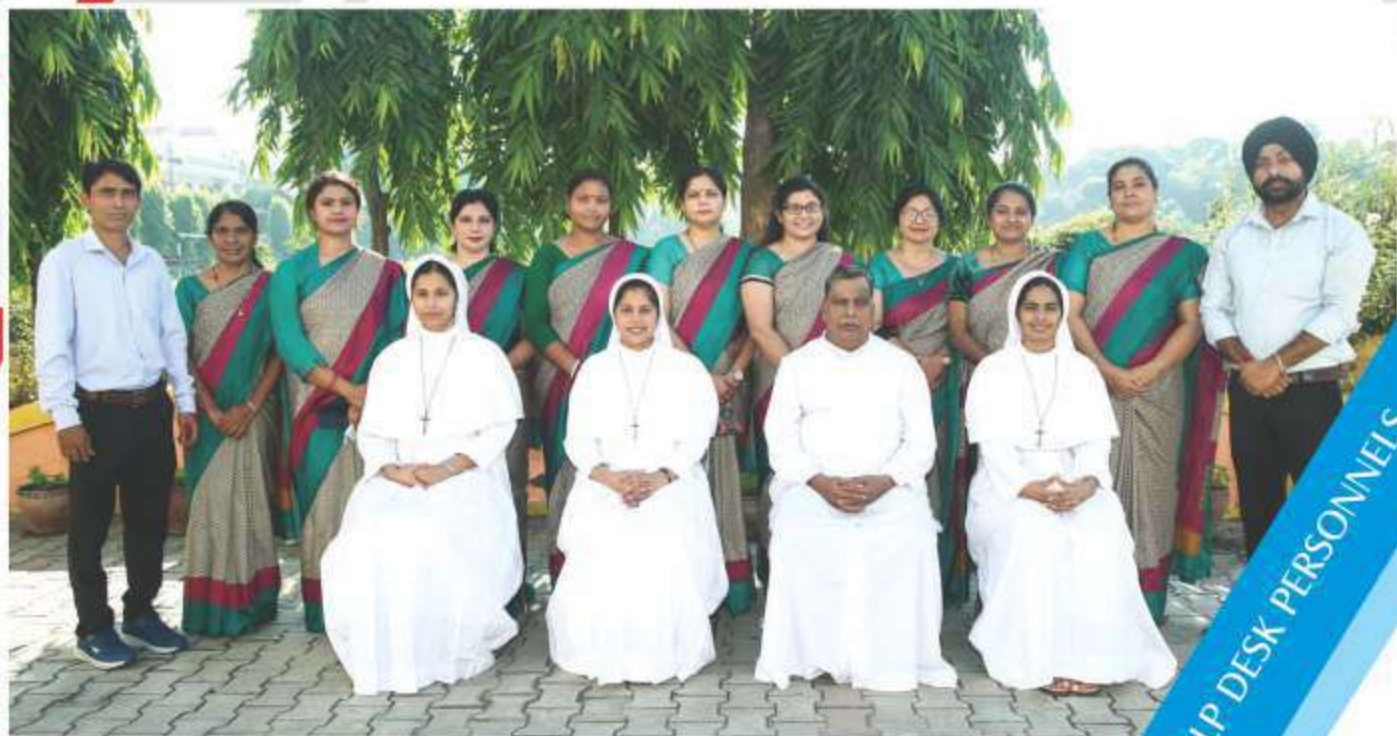
HELP DESK PERSONNELS