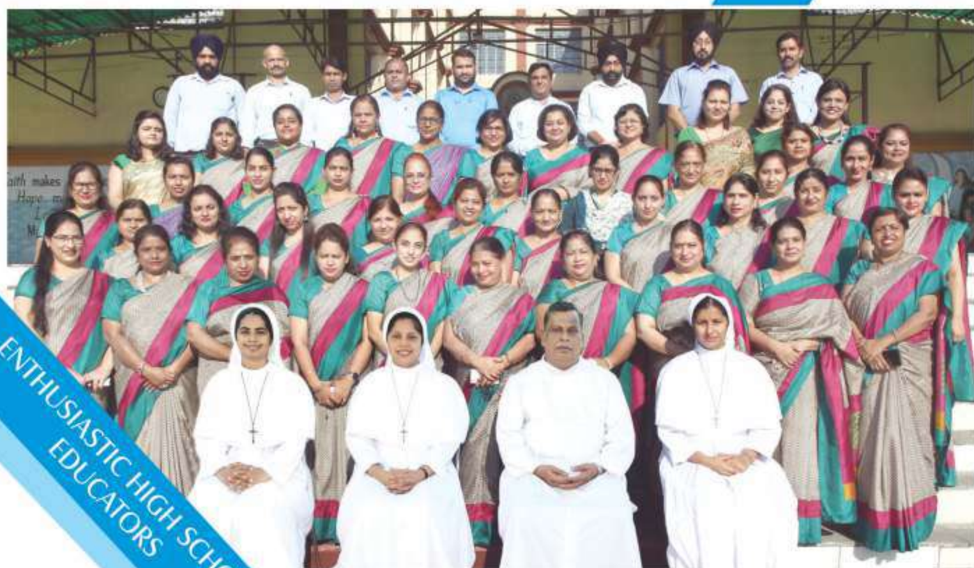
ENTHUSIASTIC HIGH SCHOOL EDUCATORS