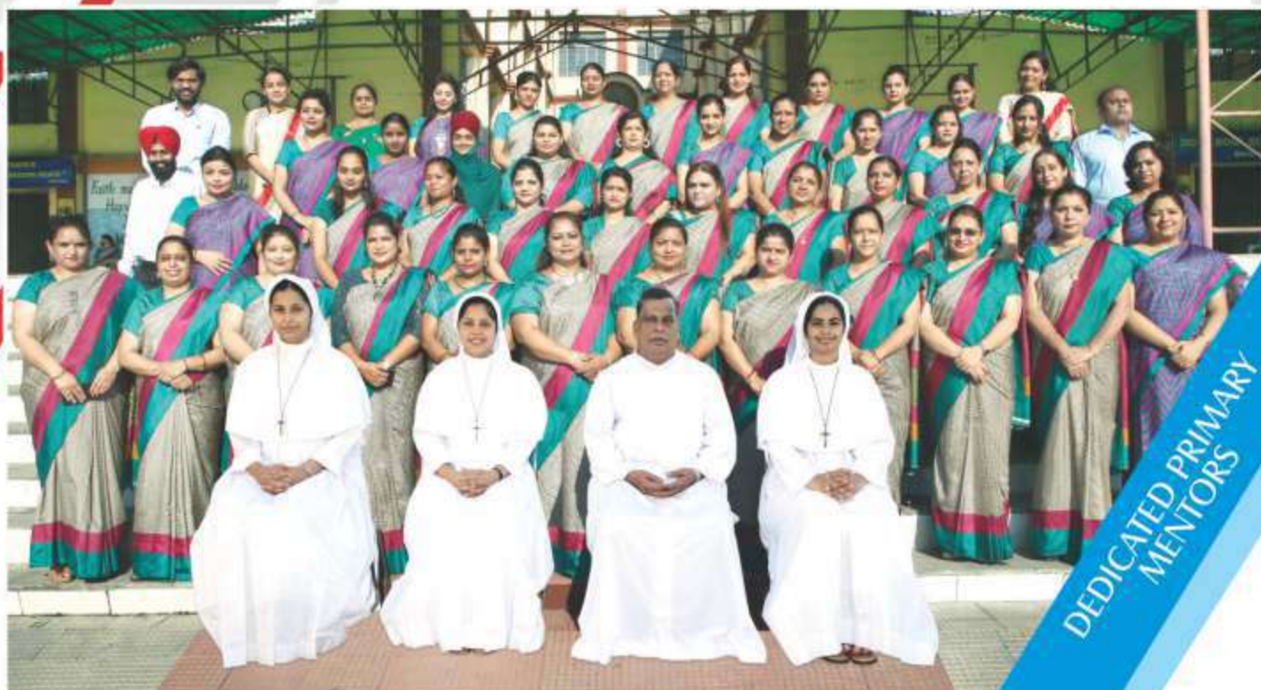
DEDICATED PRIMARY MENTORS